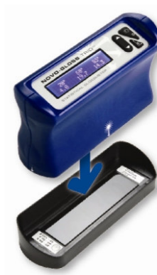
Place the instrument in the calibration holder.

If the instrument has not been used for some time it is advisable to check the calibration.