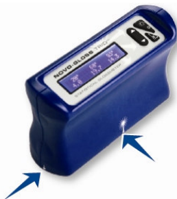
The measurement position is indicated by the arrows.

When the instrument is placed on a sample the aperture is hidden, the centre of the measurement area can be pinpointed by the intersection of the arrows marked on the front of the instrument case with those on the side.